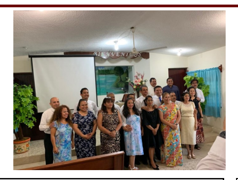
Elders and deacons appointed for the first time this past August at the La Curva congregation in Tampico, Mexico