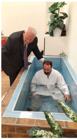
He is starting a new life