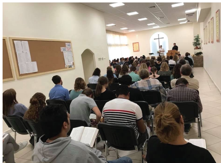
Learning the Truth

It is Friday... following this uplifting worship service, we have dinner...for all 60+ of us! The local congregation provides this every week. OK, so some come for the “loaves and fishes.” Jesus fed all who came. Following in the footsteps of Jesus, we feed without asking any questions. Every time, many linger to ask more questions. You may ask, “Where is all this leading?” Our response, “More than 200 have been baptised out of the 800 who have come to worship with us. We pray it leads to Heaven for everyone who has a heart for God and His Son.”