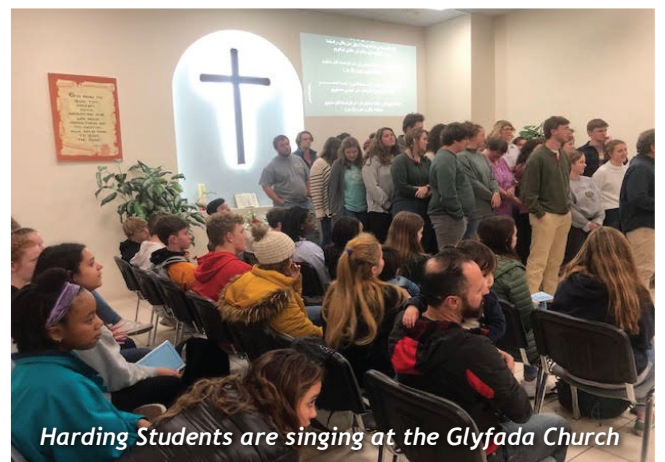
Harding Students are singing at the Glyfada Church