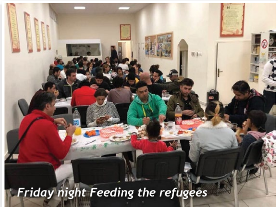
Friday night Feeding the refugees