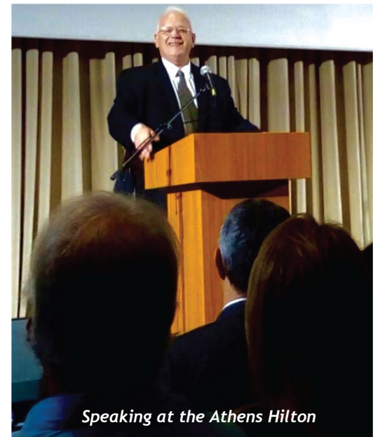
Speaking at the Athens Hilton