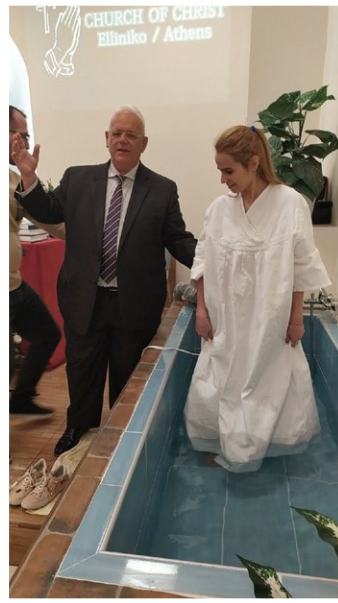
Praise the Lord