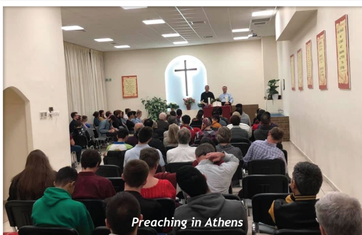
Preaching in Athens