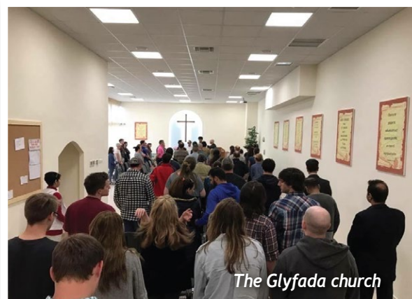
The Glyfada church