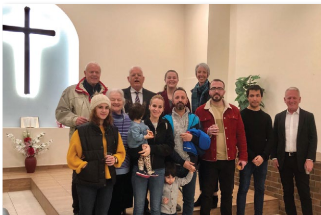
After baptism .. they rejoice